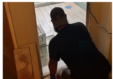
Above: The team in action, creating a renewed, updated home environment for our veterans.