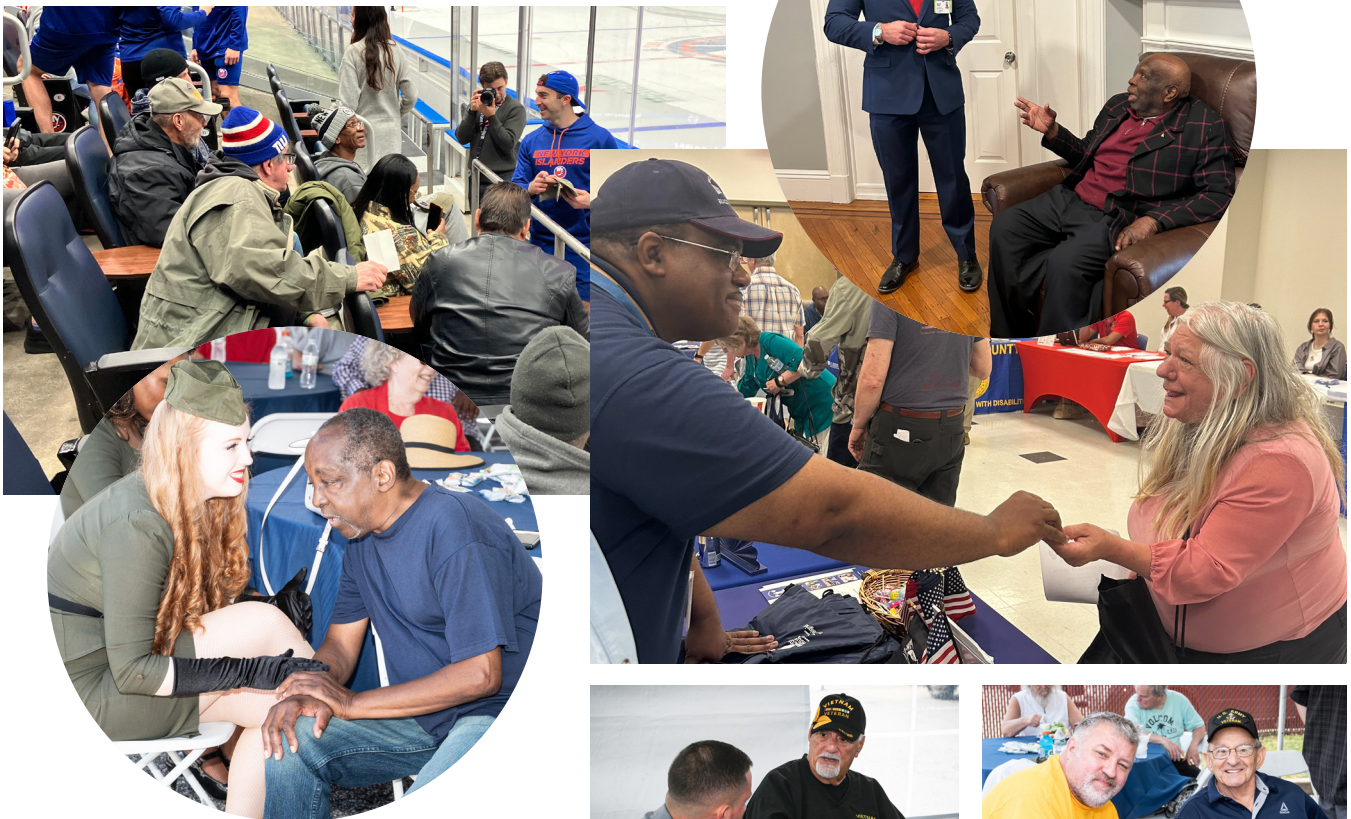
Veterans outreach and engagement in 2024 included an Islanders Game, Suffolk County Veterans Stand Down, and Beacon House events Mission in Motion and the annual Fourth of July BBQ.